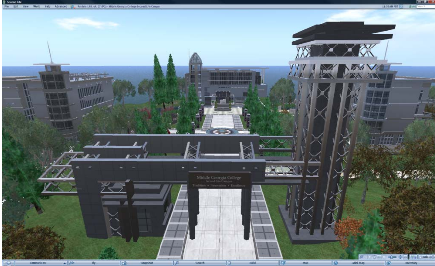
Figure 4: Georgia Middle College within Second Life