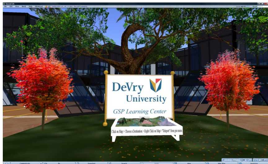
Figure 3: DeVry University's GSP Program site within Second Life