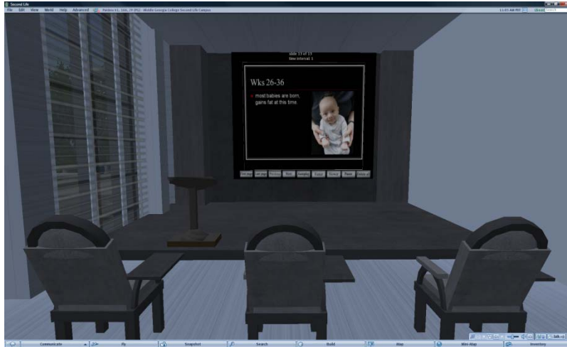
Figure 1: Example virtual classroom from Middle Georgia College, Second Life Campus